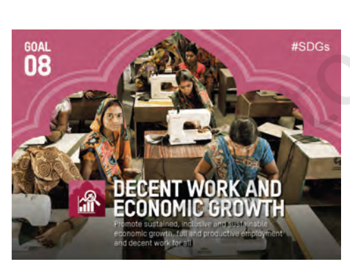
Sustainable Development Goal (SDG) www.in.undp.org

Ship-breaking is another hazardous industry that is growing rapidly in South Asia. Old ships no longer in use, are sent to ship-yards in Bangladesh and India for scrapping. These ships contain potentially dangerous and harmful substances. This photo shows workers breaking down a ship in Alang, Gujarat.