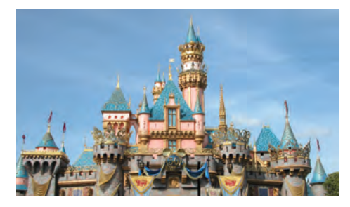
Recently a large travel agency was asked to pay Rs 8 lakh as compensation to a group of tourists. Their foreign trip was poorly managed and they missed Disneyland and shopping in Paris. Why did the victims of Bhopal gas tragedy then get so little for a lifetime of misery and pain?

Can you point to a few other situations where laws (or rules) exist but people do not follow them because of poor enforcement? (For example, over-speeding by motorists, not wearing helmet/seat belt and use of mobile phone while driving). What are the problems in enforcement? Can you suggest some ways in which enforcement can be improved?