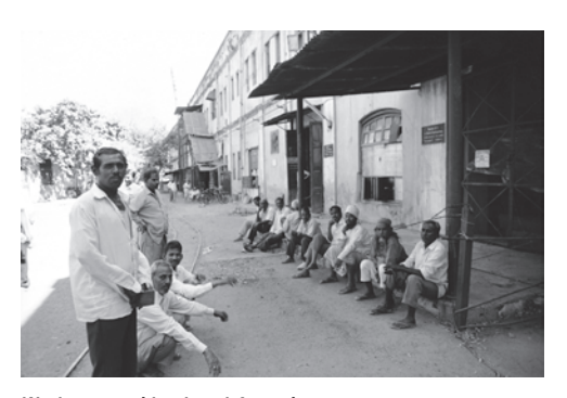
Workers outside closed factories. Thrown out of work, many of the workers end up as small traders or as daily-wage labourers. Some might find work in even smaller production units, where the conditions of work are even more exploitative and the enforcement of laws weaker.

Emissions from vehicles are a major cause of environmental pollution. In a series of rulings (1998 onwards), the Supreme Court had ordered all public transport vehicles using diesel were to switch to Compressed Natural Gas (CNG). As a result of this move, air pollution in cities like Delhi came down considerably. But a recent report by the Center for Science and Environment, New Delhi, shows the presence of high levels of toxic substance in the air. This is due to emissions from cars run on diesel (rather than petrol) and a sharp increase in the number of cars on the road.