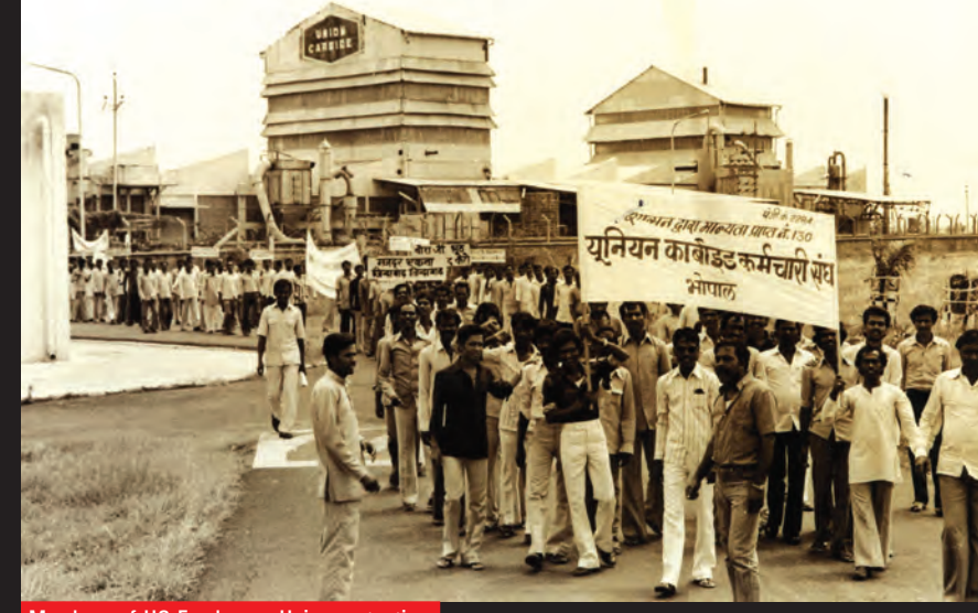
Members of UC Employees Union protesting

The disaster was not an accident. UC had deliberately ignored the essential safety measures in order to cut costs. Much before the Bhopal disaster, there had been incidents of gas leak killing a worker and injuring several.