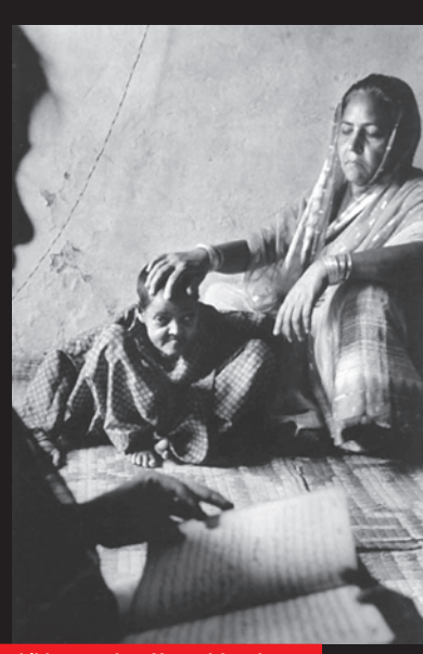
A child severely affected by the gas

Most of those exposed to the poison gas came from poor, working-class families, of which nearly 50,000 people are today too sick to work. Among those who survived, many developed severe respiratory disorders, eye problems and other disorders. Children developed peculiar abnormalities, like the girl in the photo.